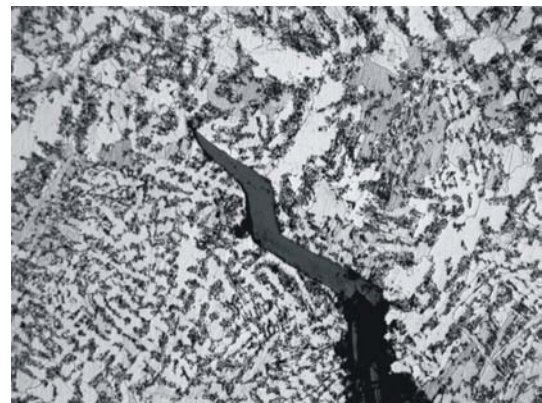
(b) The crack inner end ( \times 100 )