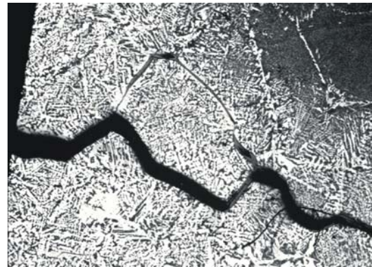
(a) The crack surface end ( \times 25 )

Figure 2 is the metallograph of the transverse corner crack in Shougang hull structural slab. We can see from it that around the crack there is no visible decarburizing and oxidizing, and the crack expands along the boundary of austenite grain.